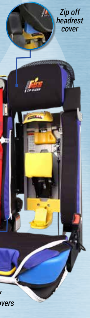
Zip off headrest cover